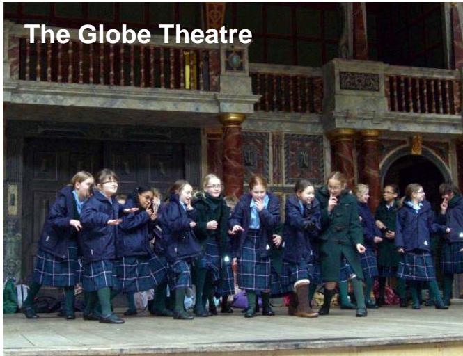
The Globe Theatre

On a cold, snowy morning Prep 6 girls set off to The Globe Theatre to see for themselves how different Shakespeare's theatre would have been from modern theatres. They were obviously not disappointed judging by the 'oohs' and 'ahh's' as they walked through the doors into the 'groundlings' space and then sampled the thin, hard wooden benches of spectators. Having participated in a workshop exploring the influences on Macbeth, the play they are studying in school at the moment, the girls then performed some sketches on the Globe's stage, a moment to be remembered for ever. The exhibition was also a highlight, learning about the archaeological discovery of the original Globe's location and its subsequent reconstruction.