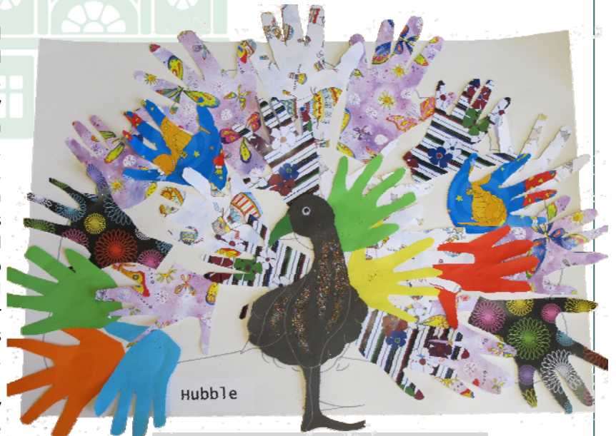
Amazing Hand Span from the Science Circus